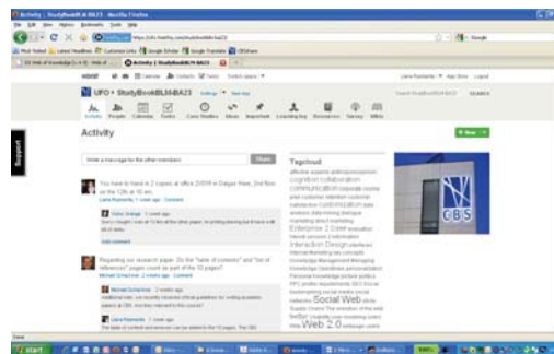
Figure 1: Screenshot of the StudyBook platform.

project work had to be constructed collaboratively using wikis and afterwards had to make a presentation. 2) Work individually: In the second step, students have to continue to work on the selected topic individually in order to write a ten page report that will be graded.